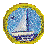
Small Boat Sailing